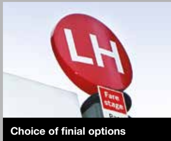
Choice of final options