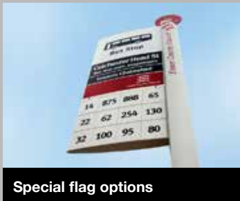
Special flag options