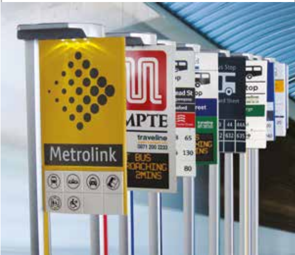
The choice of many major cities

Trueform's in-house signage graphics department can produce tailor made full colour flag graphics to suit customer requirements.