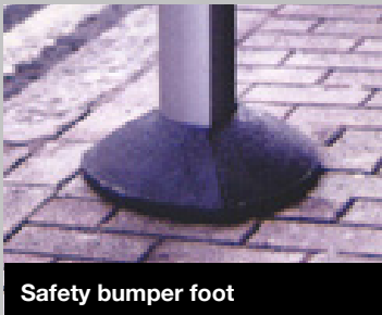
Safety bumper foot