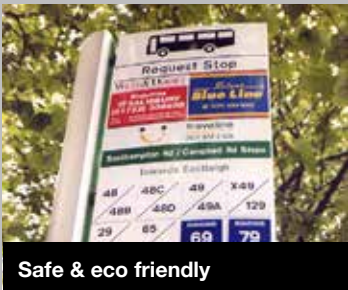
Safe & eco friendly