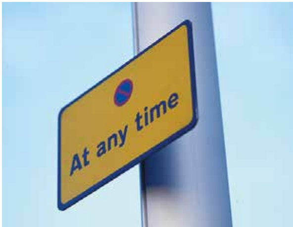
Fitting channel for DOT signs

The Elite E-Paper Bus Post System can be supplied in both mains and solar powered illumination. Solar energy is a long term, cost effective method of illuminating bus stops. Trueform is leading the way in the provision of sustainable design and cleaner green energy on street furniture.