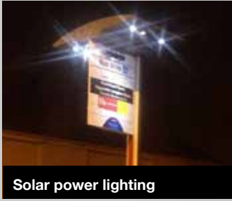
Solar power lighting