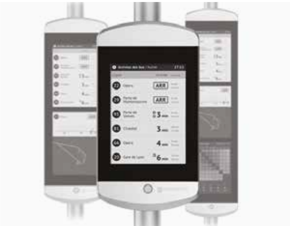
Single, double & triple E-Paper displays