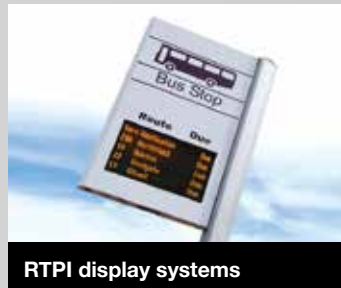
RTPI display systems