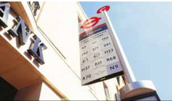
London buses bus stop

Trueform supply a range of attractive display sign flags, each capable of fitting to the new 'Elite' post, to conventional square sign posts or to lighting columns. The sign plates are of a unique curved cross section construction for maximum strength and resistance to vandalism. The flags can be quickly and effortlessly removed from the post to enable route number changes to be carried out safely at ground level.