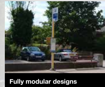
Fully modular designs