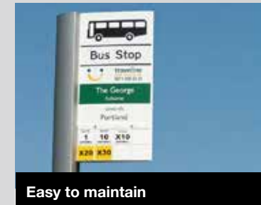
Easy to maintain