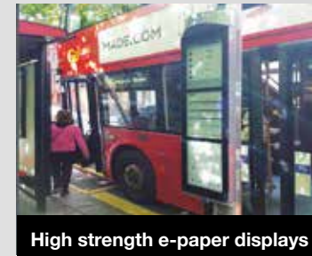
High strength e-paper displays