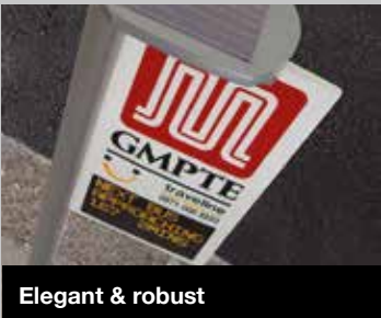
Elegant & robust