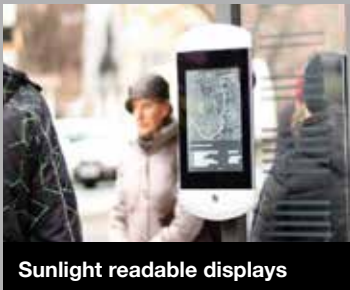
Sunlight readable displays