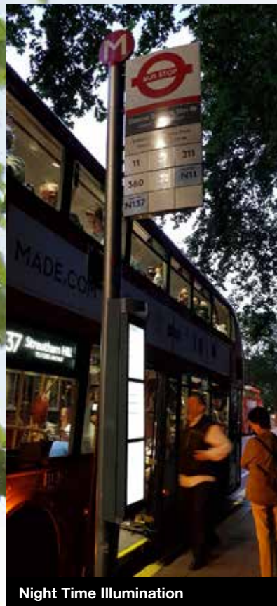
Night Time Illumination

STRONG, LONG LASTING & LIGHTWEIGHT CONSTRUCTION