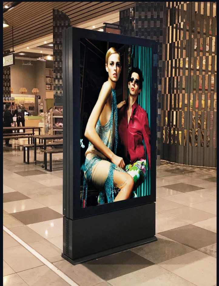
Full Outdoor/Indoor Displays