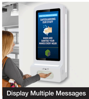
Display Multiple Messages