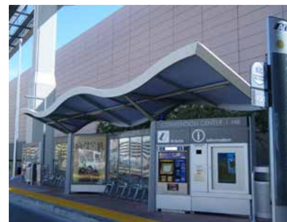
Sinewave BRT Ref: 1A 016