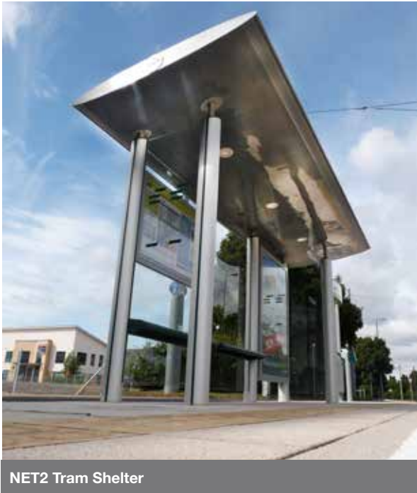
NET2 Tram Shelter