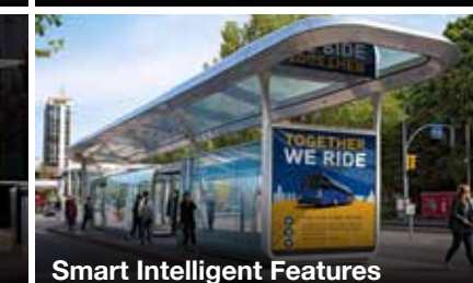
Smart Intelligent Features