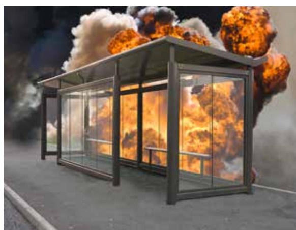
Aviator Anti-Terrorist Ref: 1A 014