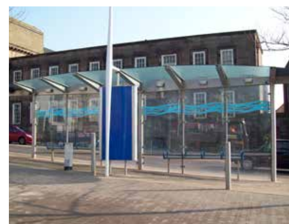
Burslem Ref: 1A 018