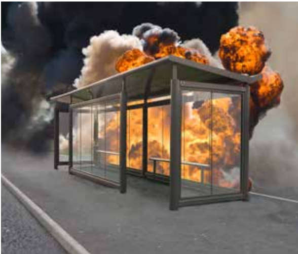
London Heathrow Bomb Blast Protected Shelter

Factory fabricated and pre-assembled, the sub-assembled parts are packaged and shipped to site. After delivery, the components can be readily assembled, allowing reduced site occupancy times, reduced costs and shorter programme times.