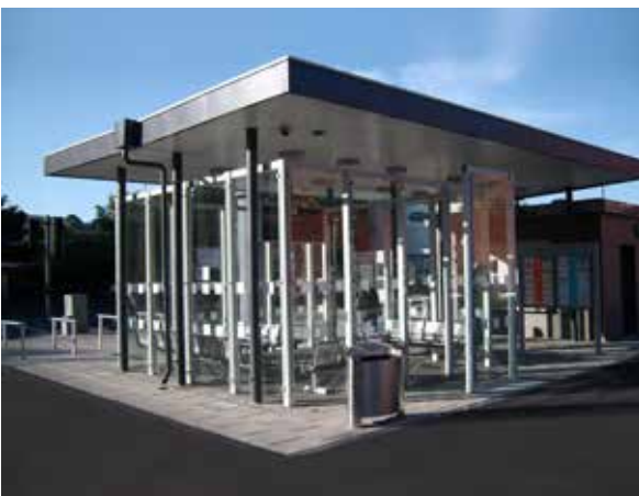
Redhill Bus Station