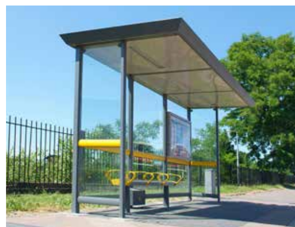
Legacy Ref: 1A 007