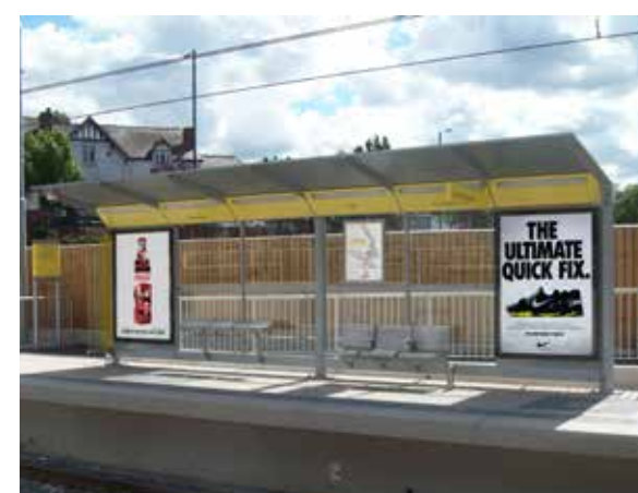
Integra Platform Ref: 1A 020.1