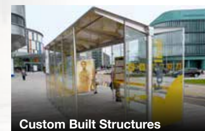
Custom Built Structures