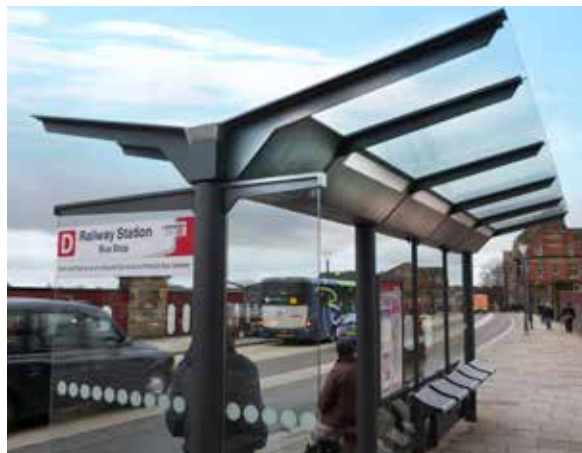
Fishergate Gullwing Ref: 1A 002.1