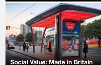
Social Value: Made in Britain