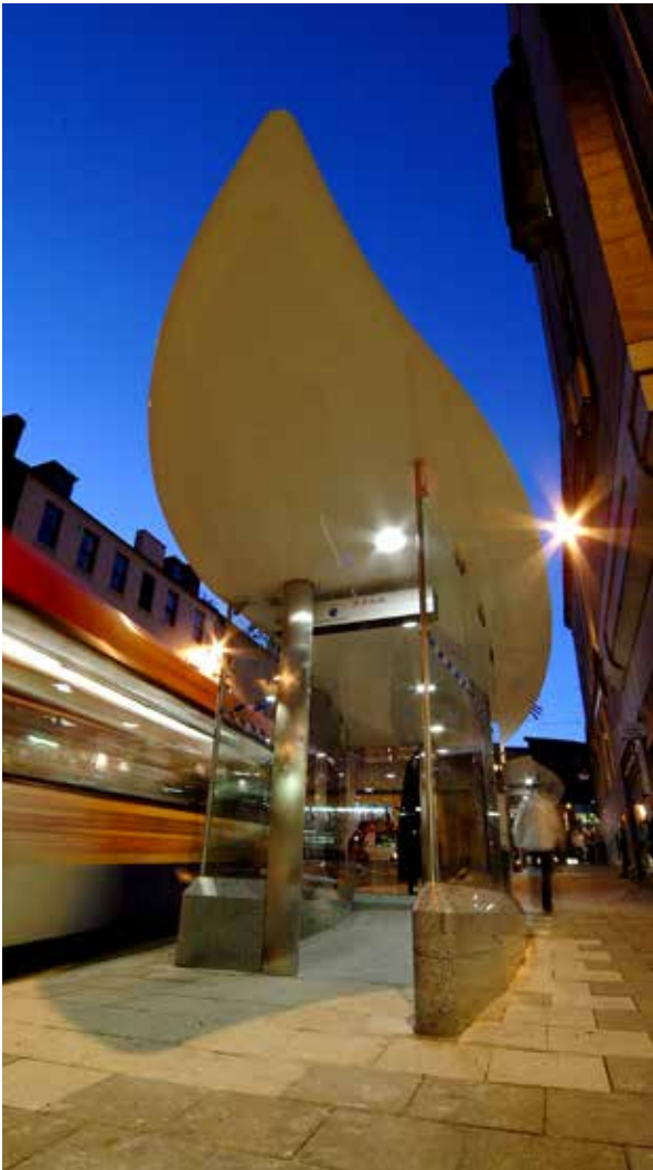
Dundee Discovery Bus Shelter