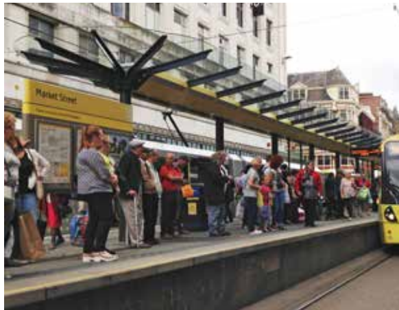
Market Street Integra