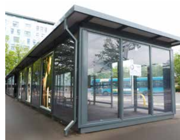
MK Station Shelter