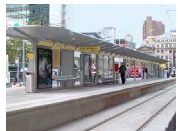
Integra Ref: 1A 020