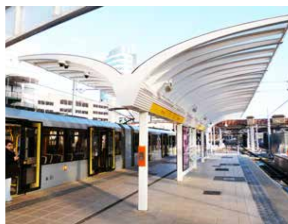
TfGM Victoria Platform