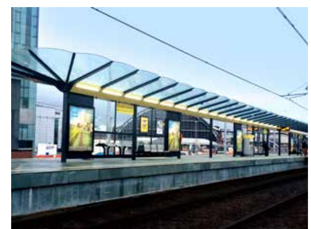
Deansgate Integra Ref: 1A 020.2