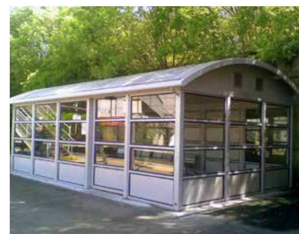
Prestige Rail Waiting