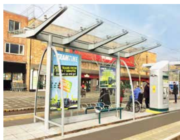
NET2 Mini Gullwing