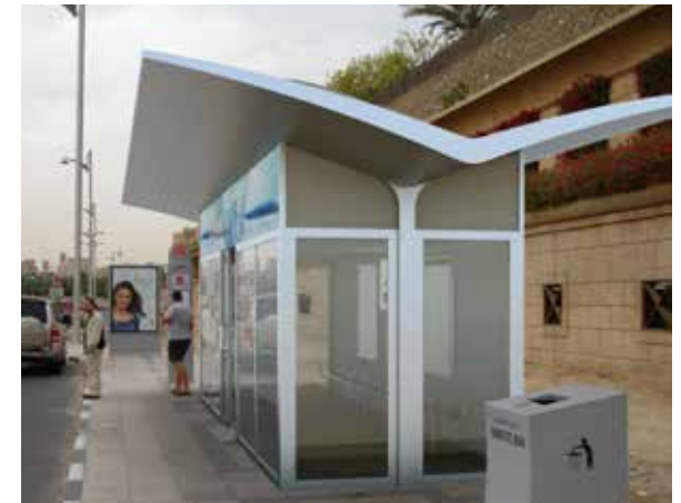
Solar Air Conditioned