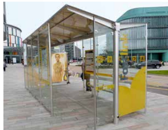
Gullwing BRT Ref: 1A 002.2