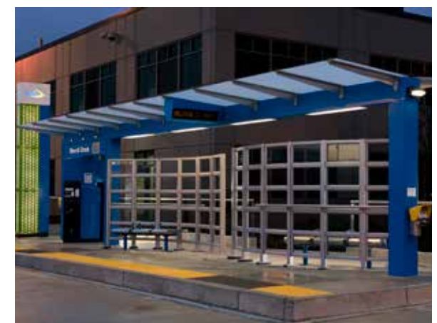
Seattle Ref: 1A 017