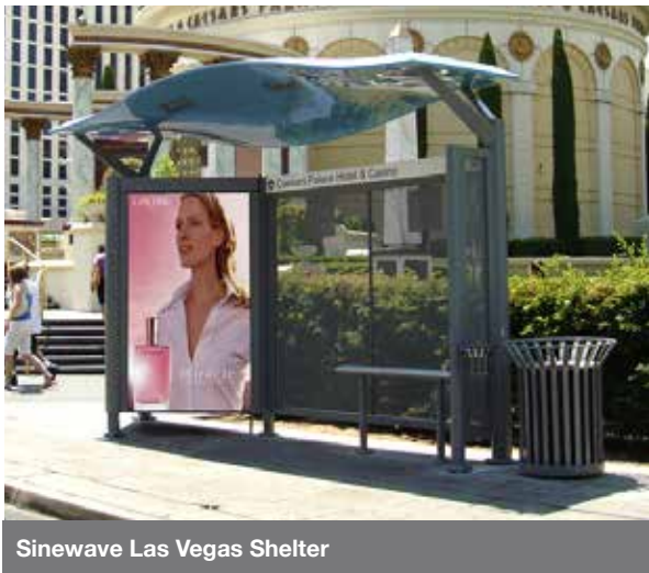
Sinewave Las Vegas Shelter