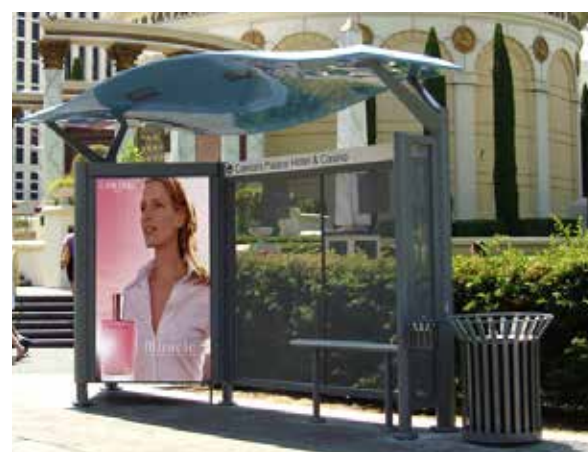
Sinewave Ref: 1A 015