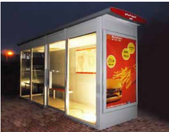
Air Conditioned Landmark