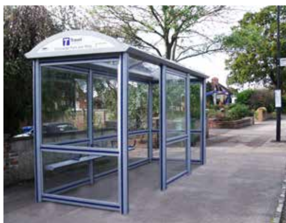
Premium Ref: 1A 006.1