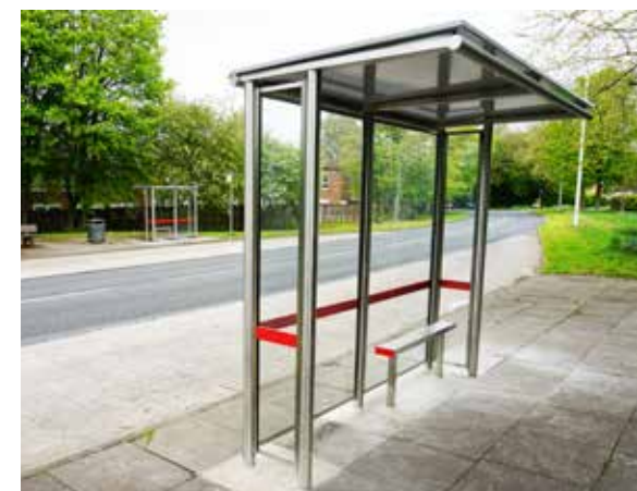
Vision Eco Shelter