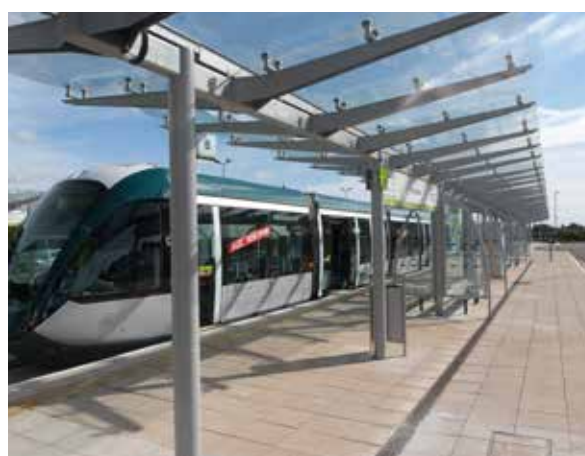
NET2 Gullwing Tram