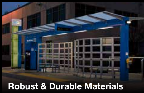
Robust & Durable Materials