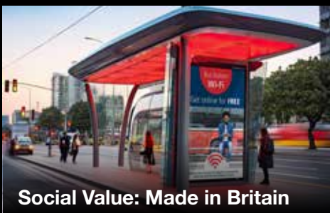
Social Value: Made in Britain