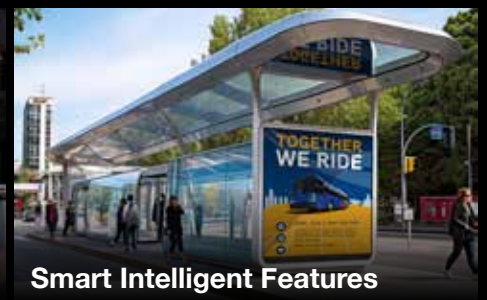
Smart Intelligent Features