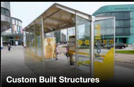
Custom Built Structures